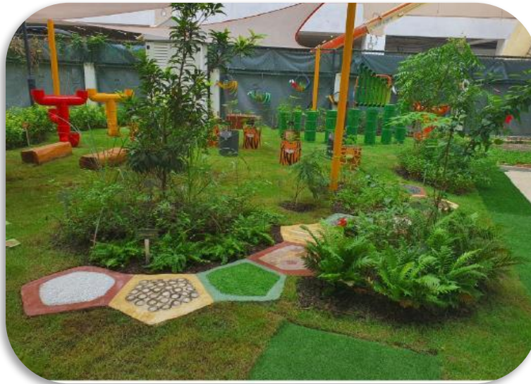
▲ Sensory garden