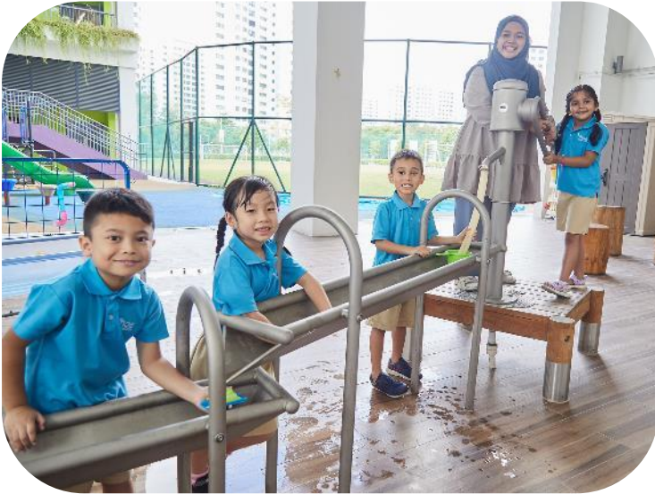
▲ Water play area

Specially designed to provide a variety of play experiences